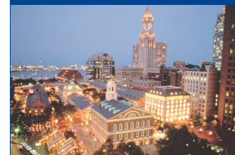
Faneuil Hall Marketplace