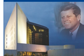
JFK Library & Museum