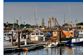
Historic Gloucester "America's Oldest Seaport"