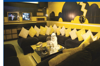
One of many Graceland's Themed Rooms