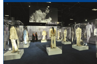
A Collection of Elvis' Outfits