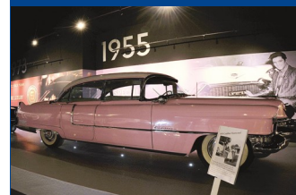
See the Iconic Pink Cadillac