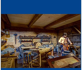
View from Inside the Arl Encounter