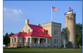
Mackinac Point Lighthouse