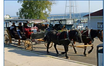
Tour Mackinac Island by Horse and Carriage