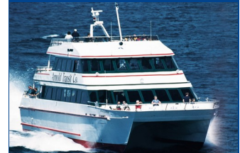
Mackinac Island Ferry