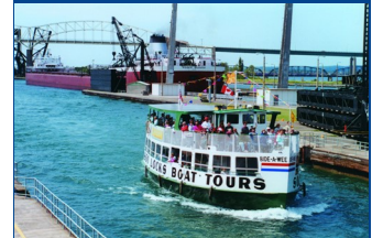
Soo Locks Cruise in Sault Sainte Marie