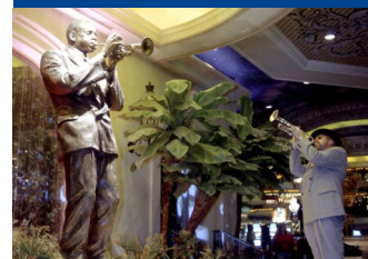
New Orleans - "Birthplace of Jazz"