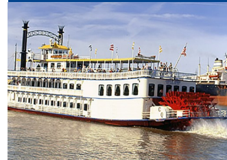
Enjoy a Riverboat Cruise

Departure: Multi-Purpose Center, 3000 W Jefferson St, Joliet, IL @ 8 am