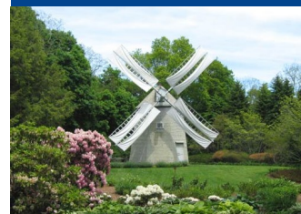
One of Cape Cod's many Windmills