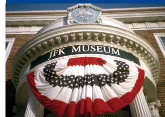
Visit to the JFK Museum