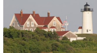
Lighthouse overlooking Vineyard Sound