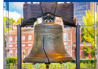
Take a visit to Philadelphia