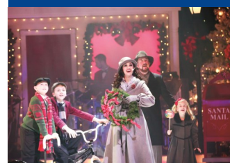
Enjoy "JOY TO THE WORLD" Show at the American Music Theatre