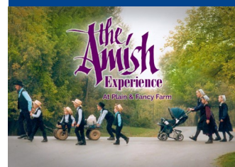
Experience the Amish lifestyle

Departure: Multi-Purpose Center, 3000 W Jefferson St, Joliet, IL @ 8 am