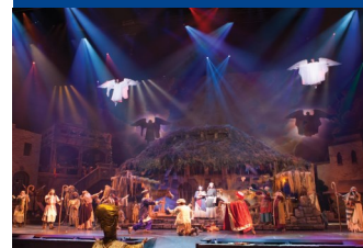
Enjoy the "THE MIRACLE OF CHRISTMAS" Show