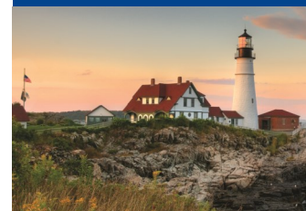
See the Portland Head Lighthouse

Departure: Multi-Purpose Center, 3000 W. Jefferson St, Joliet, IL @ 8 am