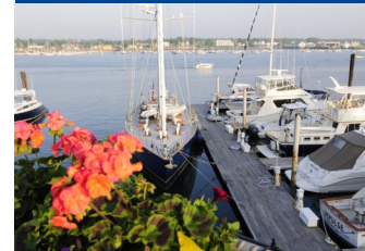
Enjoy the historic Portland Waterfront