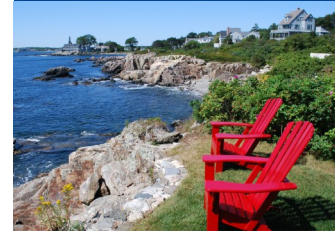
Explore quaint Kennebunkport