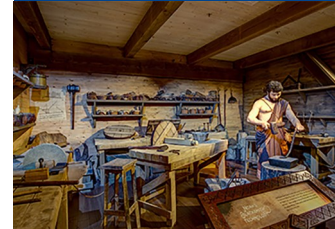
View from Inside the Ark Encounter