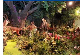
Visit to the Amazing Creation Museum!