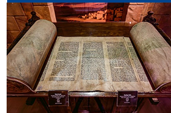
Bible Scroll Exhibit at the Ark Encounter