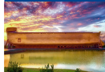
Incredible Ark Encounter

Departure: Kentucky Opry, 88 Chilton Ln, Benton, KY @ 8 am