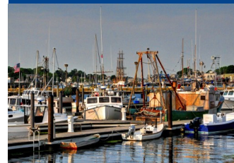
Historic Gloucester "America's Oldest Seaport"