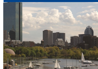
A guided tour of Boston