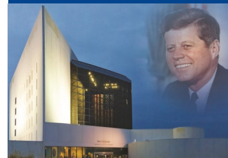
JFK Library & Museum